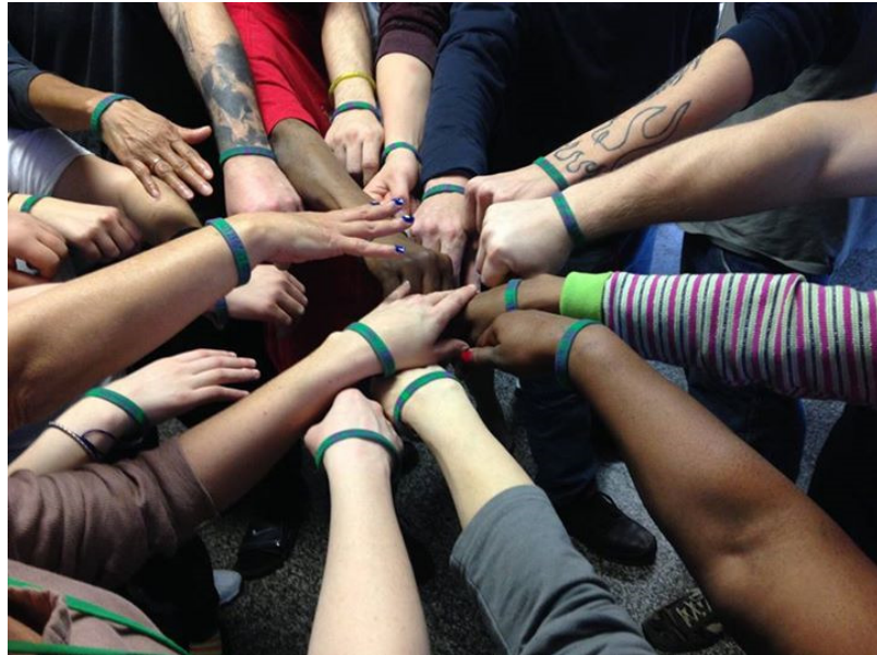
Shoemaker Alumni sporting their wristbands! To order, go to Quick Links!

Wristbands: No Shame or Blame ~ Just Love(R)